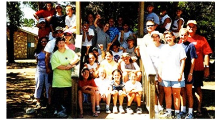
First L.I.T. group from Wedgwood Baptist Church, 2002.

In the summer of 2002, the Lord birthed a fresh vision for children called L.I.T. (Leaders In Training). In a matter of 20 years, L.I.T. has grown to impact thousands of children around the world. We are in awe at God's amazing plan to reach, disciple, and empower children to be the church NOW. The Lord is raising up a generation of disciples in our midst. What we have learned from 30+ mission trips is that when we train children to be missionaries and take them out on mission, they experience Acts 1:8. They don't fully grasp how God works, but the Holy Spirit takes over in their times of fear and speaks boldly the name of Christ through them.